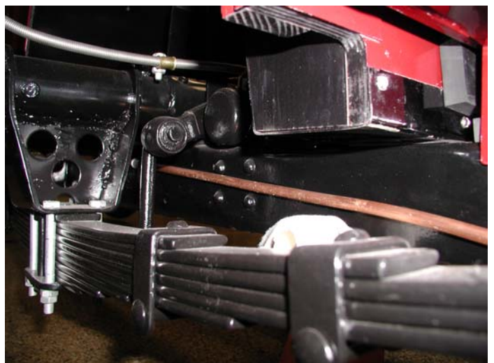
4 – Routing under side curtain box.