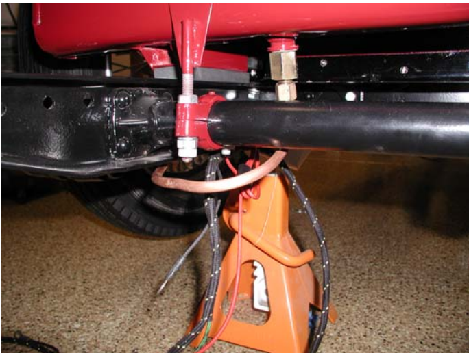
1- Fuel line passes under rear cross member

The following photos are in sequence to show the TC fuel line routing from the tank to the pump.