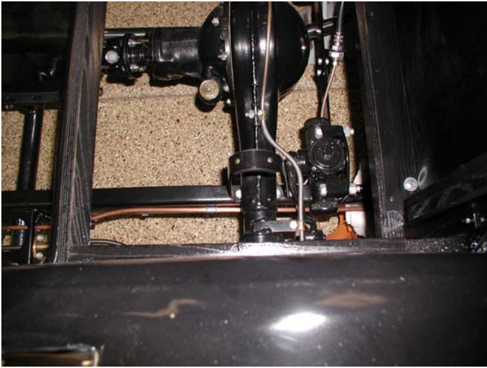
5 – Routing along main frame