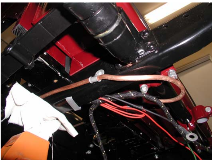
3 – Original fuel line shows pitting from road debris