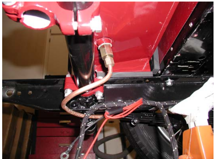
2- Be careful not to crimp fuel line when using jack