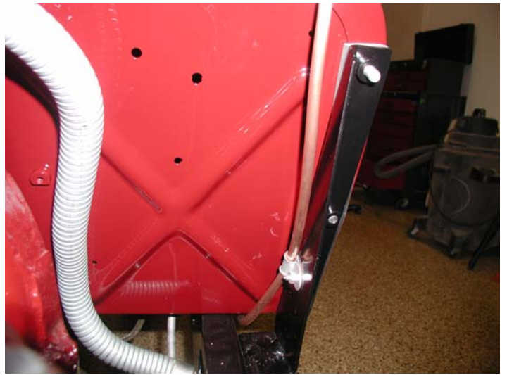
8- All clips are held by 2BA setscrew