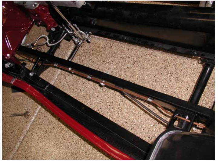
6 – Total of 7 clips from tank to pump